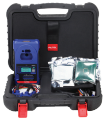
ADVANCED ALL-IN-ONE KEY PROGRAMMER

ADD EUROPEAN VEHICLE COVERAGE TO YOUR IM508 OR IM608 WITH THE XP400PRO